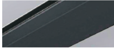
Anthracite on White