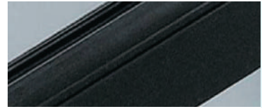
Black & Black on White