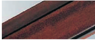
Mahogany & Mahogany on White

Further options available - visit our website