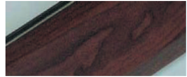
Rosewood & Rosewood on White